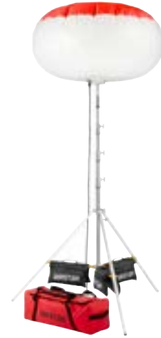
Sirocco Redtech 1300