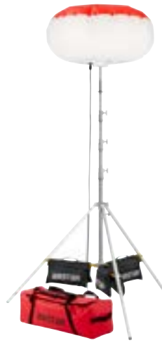
Sirocco Redtech 700

All-in-one product Up to 8 hours of autonomy