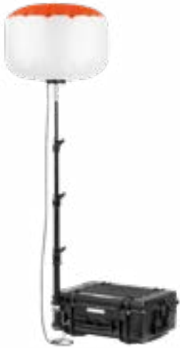
Sirocco 6 000 ou 12 000 Im Pro-Pack

All-in-one product Up to 8 hours of autonomy