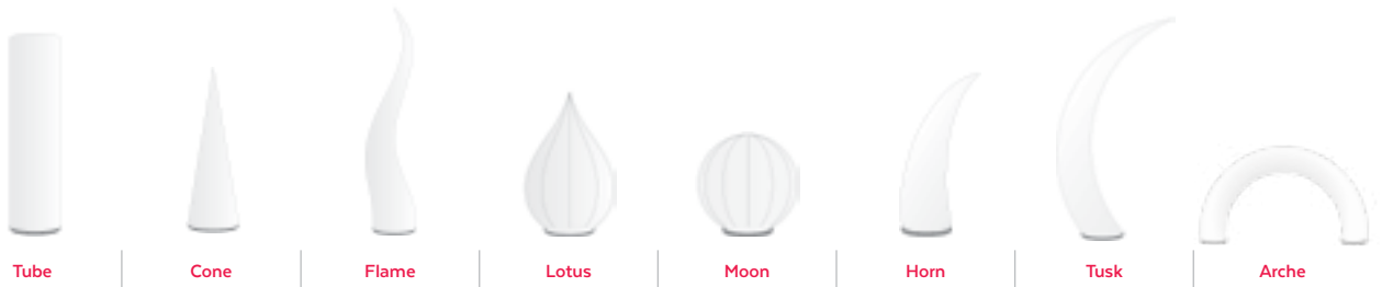
Tube Cone Flame Lotus Moon Horn Tusk Arche